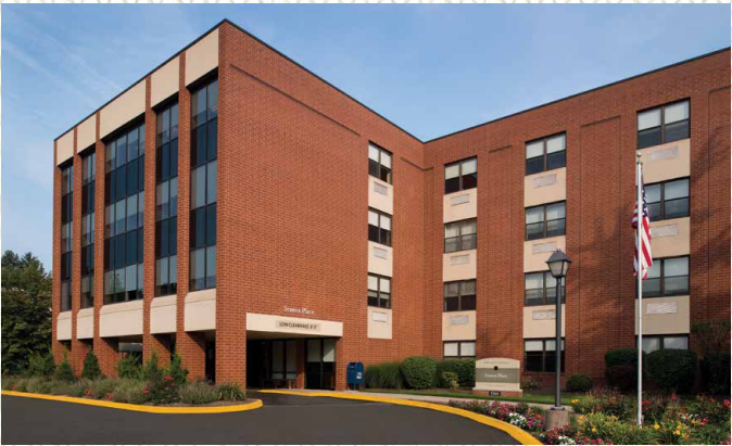
Seneca Place 5360 Saltsburg Road, Verona, PA 15147 412-798-8000