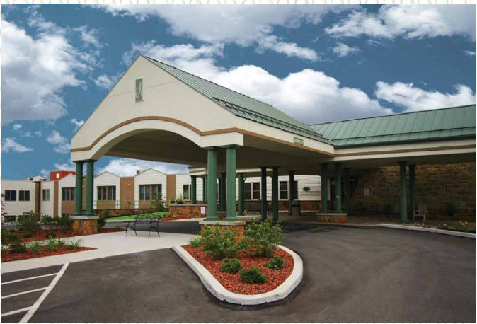
Avalon Springs Place 745 Greenville Road, Mercer, PA 16137 724-662-5400