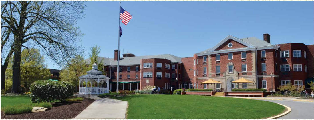
Asbury Heights 700 Bower Hill Road Pittsburgh, PA 15243 412-571-5182

For referrals to the majority of the UPMC Senior Communities skilled nursing and rehabilitation facilities, please call the UPMC Senior Communities Central Admissions Office at 412-688-3900. For information on other UPMC Senior Communities levels of care including independent living, personal care, assisted living, and memory care call 1-800-424-6623. Or visit us on www.UPMCSeniorCommunities.com .