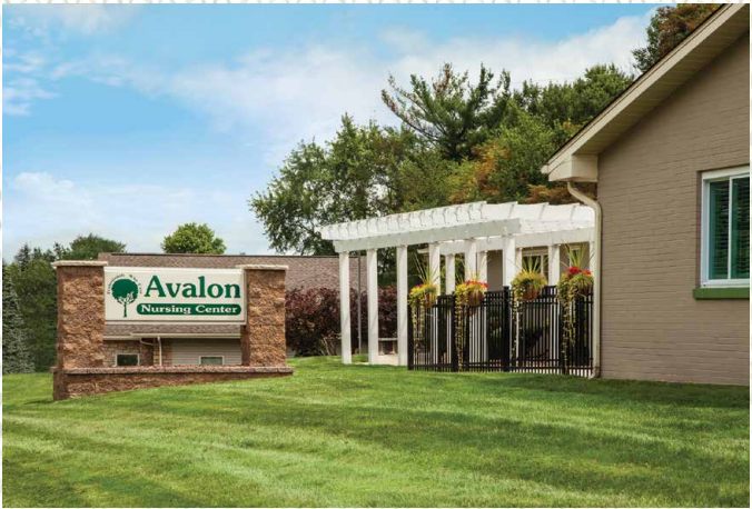
Avalon Place 3410 W. Pittsburg Road, New Castle, PA 16101 724-658-4781