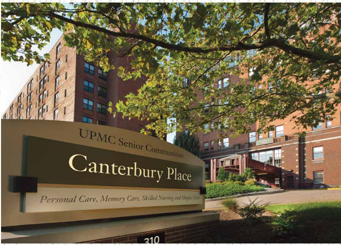
Canterbury Place 310 Fisk Street, Pittsburgh, PA 15201 412-622-9000