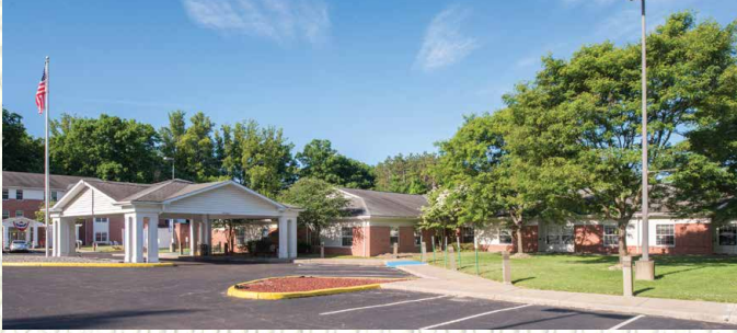
Jameson Care Center 3349 Wilmington Road, New Castle, PA 16105 724-598-3300