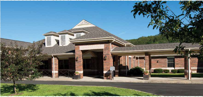
Sugar Creek Station 351 Causeway Drive, Franklin, PA 16323 814-437-0100