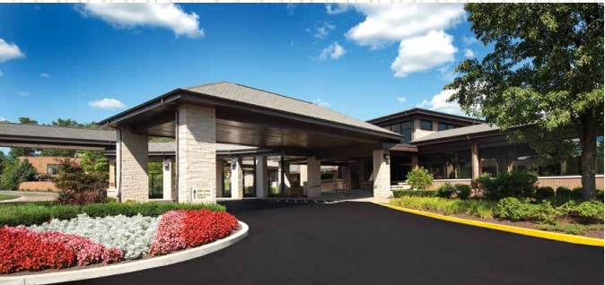
Sherwood Oaks 100 Norman Drive, Cranberry Township, PA 16066 724-776-8100