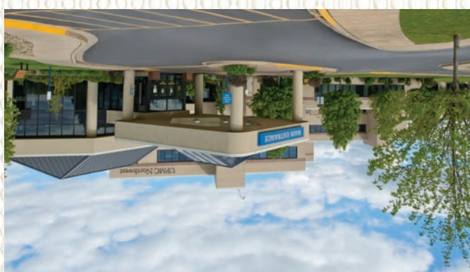
UPMC Northwest TCU

814-678-4648 100 Fairfield Drive, Seneca, PA 16346