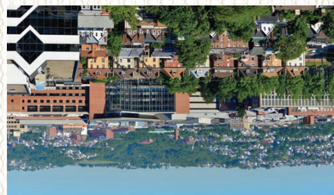
UPMC Magee-Womens Hospital TCU

412-641-3310 300 Halket Street, Pittsburgh, PA 15213