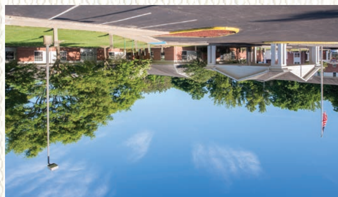
Jameson Care Center

724-598-3300 3349 Wilmington Road, New Castle, PA 16105