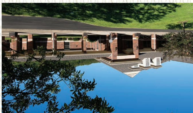
Sugar Creek Station

814-437-0100 351 Causeway Drive, Franklin, PA 16323