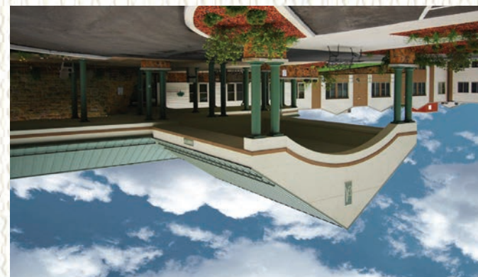
Avalon Springs Place

724-662-5400 745 Greenville Road, Mercer, PA 16137