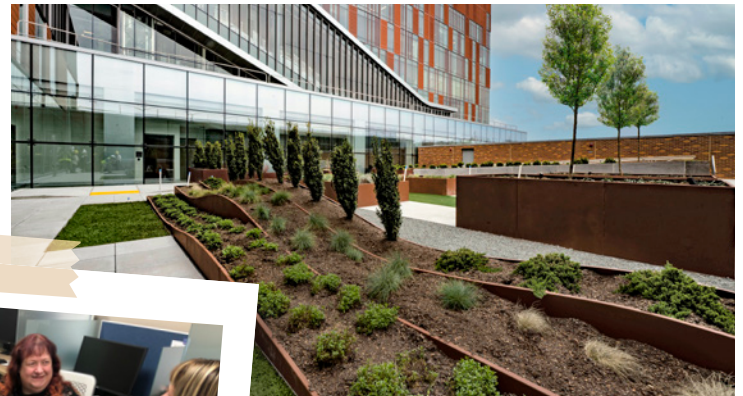
BELOW: UPMC Mercy Pavilion rooftop garden.