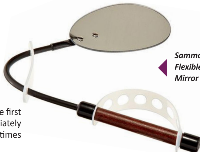
Sammons Preston Flexible Inspection Mirror