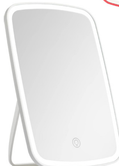
NEZZOE Makeup Mirror Touch Screen Vanity Mirror with LED brightness