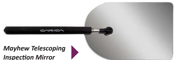
Mayhew Telescoping Inspection Mirror