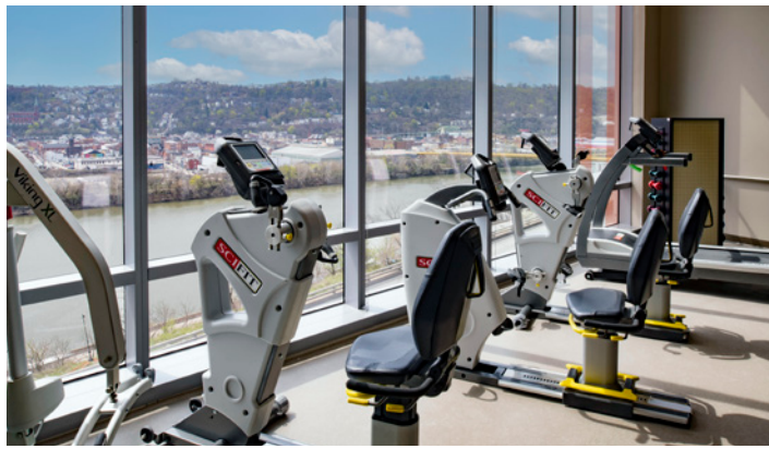
LEFT: A central gym with floor-to-ceiling windows with views of Mount Washington and the South Side Slopes.

The Rehabilitation Institute includes an innovative hybrid outpatient clinic and therapy gym, including a fully functional apartment and a healing garden on the rooftop terrace with various surfaces for learning wheelchair skills. The exam rooms are fully accessible with ceiling lifts and height adjustable examination tables. A wide, glass staircase with seating serves as a meeting space for clinicians and researchers and offers panoramic views. A glass elevator provides a similar experience for wheelchair users. The building has accessible parking and an outpatient laboratory for bloodwork and urinalysis. A bridge connects the Pavilion to the third floor of UPMC Mercy Hospital. The building was designed with input from one of the world's few blind architects. Art also plays a powerful role in the Pavilion through unique and commissioned pieces that focus on the senses, healing, culture, and empowerment. Read more about the artists and artwork featured in the Pavilion.