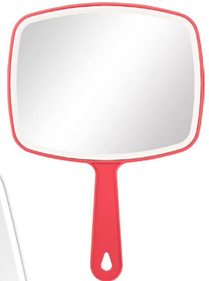
Nutair Handheld Vanity Mirror with hanging hole in handle

Some examples of tools to help you check the skin. Click on each picture to learn more.