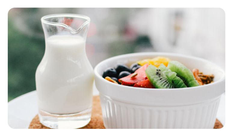
Fiction #1: Skim (cow's) milk has less protein than whole milk.

While great information can be found about food online or in other media, many misconceptions can be found just as easily. Read on to separate some common nutrition facts from fiction.