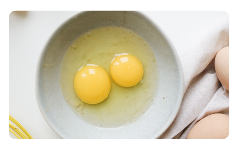
Fiction #2: Egg yolks are bad for you.

WHAT ARE THE FACTS? Skim milk and whole milk have the same amount of protein: 8 grams of protein in 1 cup. The major difference between skim and whole milks is that fat is removed in skim milk products. This means that skim milk has little to no saturated fat. Why is that a good thing? Well, fats in general provide excess calories, which is important to consider if someone is watching their weight. But specifically, saturated fat can raise the LDL (low-density lipoprotein) or "bad" cholesterol levels in our blood. Over time, this can cause a build up of cholesterol in our blood vessels and increases risk for heart disease. What about vitamins and minerals like calcium, vitamin D, and vitamin A in the milk? The calcium content of both skim and whole milks remain similar around 300 mg calcium per cup. While it is true that vitamin D and vitamin A, which are fat-soluble vitamins, are lost when fat is removed from skim milk, there is no need to worry! Most manufacturers add vitamins A and D back into skim milk. Curious to compare? Pick up two cartons in your grocery store and take a look at the Nutrition Facts Label!