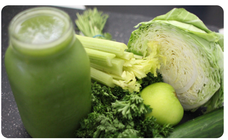
Fiction #5: Juice cleanses or detox diets are good for or refreshing for the body.

amount of honey typically consumed at a time. Honey may contain some antioxidants that sugar does not. However, it is still important to reduce your intake of added sugars overall – whether coming from honey, table sugar, brown sugar, molasses, or syrups! Think of sweet foods/drinks as a treat to be eaten in smaller amounts and less often, instead of as a daily staple. Note: Honey should never be given to children younger than 1 year of age due to risk of bacteria that causes infant botulism.