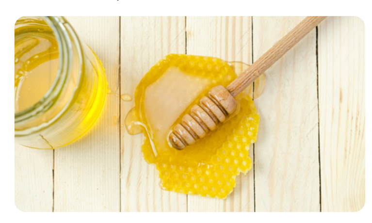
Fiction #4: Honey does not count as an added sugar.

WHAT ARE THE FACTS? Gluten is a protein found in wheat, barley, and rye. Gluten is not inherently unhealthy, nor does it cause weight gain; many people do not need to avoid it. However, there are cases when a gluten-free diet is medically necessary. For example, individuals who have a diagnosis of celiac disease must eat a gluten-free diet in order to avoid damage to their intestines. However, for people who do not have a medical need to avoid gluten, it is important to remember that just because a food is gluten-free does not automatically make it "healthy." Gluten-free cookies are no healthier in terms of calories, fat, or sugar than a gluten-containing cookie. Healthy and unhealthy foods exist in both the gluten-free and glutencontaining food worlds, so making healthy and balanced choices is still important.