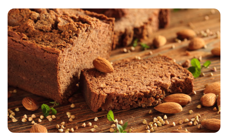
Fiction #3: Gluten-free foods are healthier.

WHAT ARE THE FACTS? Gluten is a protein found in wheat, barley, and rye. Gluten is not inherently unhealthy, nor does it cause weight gain; many people do not need to avoid it. However, there are cases when a gluten-free diet is medically necessary. For example, individuals who have a diagnosis of celiac disease must eat a gluten-free diet in order to avoid damage to their intestines. However, for people who do not have a medical need to avoid gluten, it is important to remember that just because a food is gluten-free does not automatically make it "healthy." Gluten-free cookies are no healthier in terms of calories, fat, or sugar than a gluten-containing cookie. Healthy and unhealthy foods exist in both the gluten-free and glutencontaining food worlds, so making healthy and balanced choices is still important.