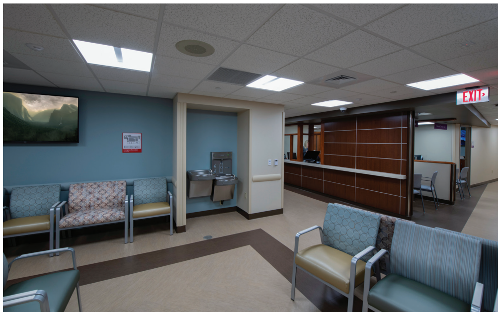
Top: Patient waiting area

Prior to the expansion, space constraints meant that many cancer patients in the Cranberry area had to travel farther to UPMC Hillman Cancer Center at UPMC Passavant–McCandless for appointments and treatments. Patients also had to travel there for clinical trials.