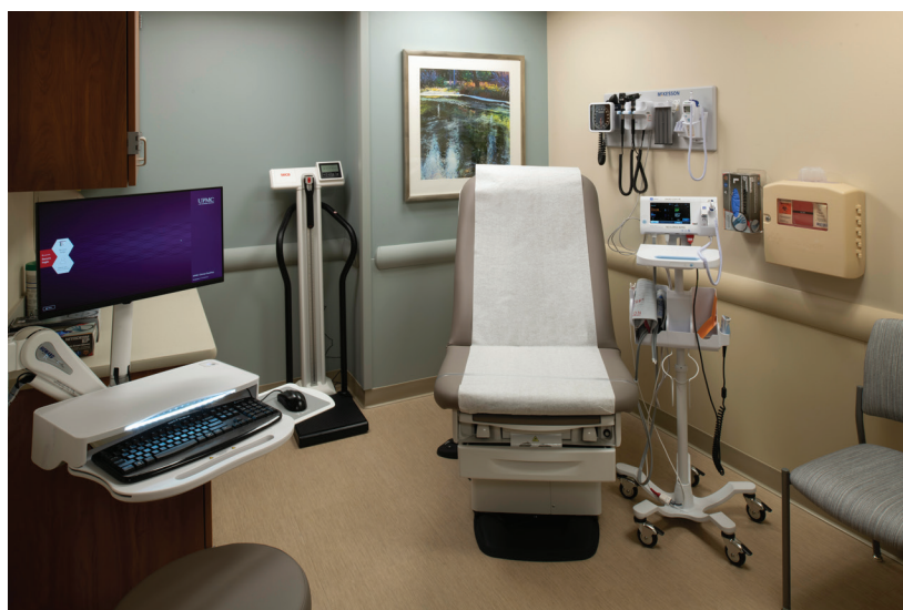
Bottom: One of two private treatment bedrooms