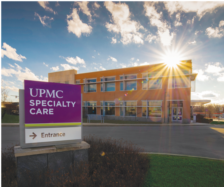
The UPMC Spine Center — located at UPMC Specialty Care in Wexford — brings together experts from multiple specialties to provide comprehensive diagnostic and outpatient care at one convenient location.