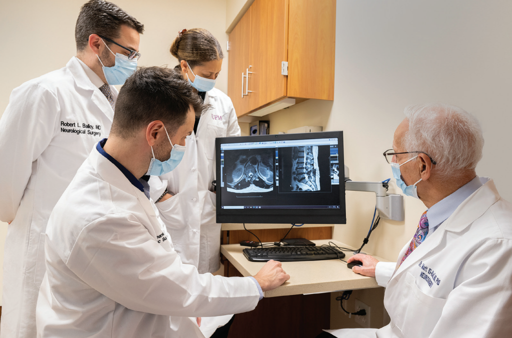
The recent addition of two surgeons has expanded the capabilities of UPMC Passavant and the UPMC Spine Center.