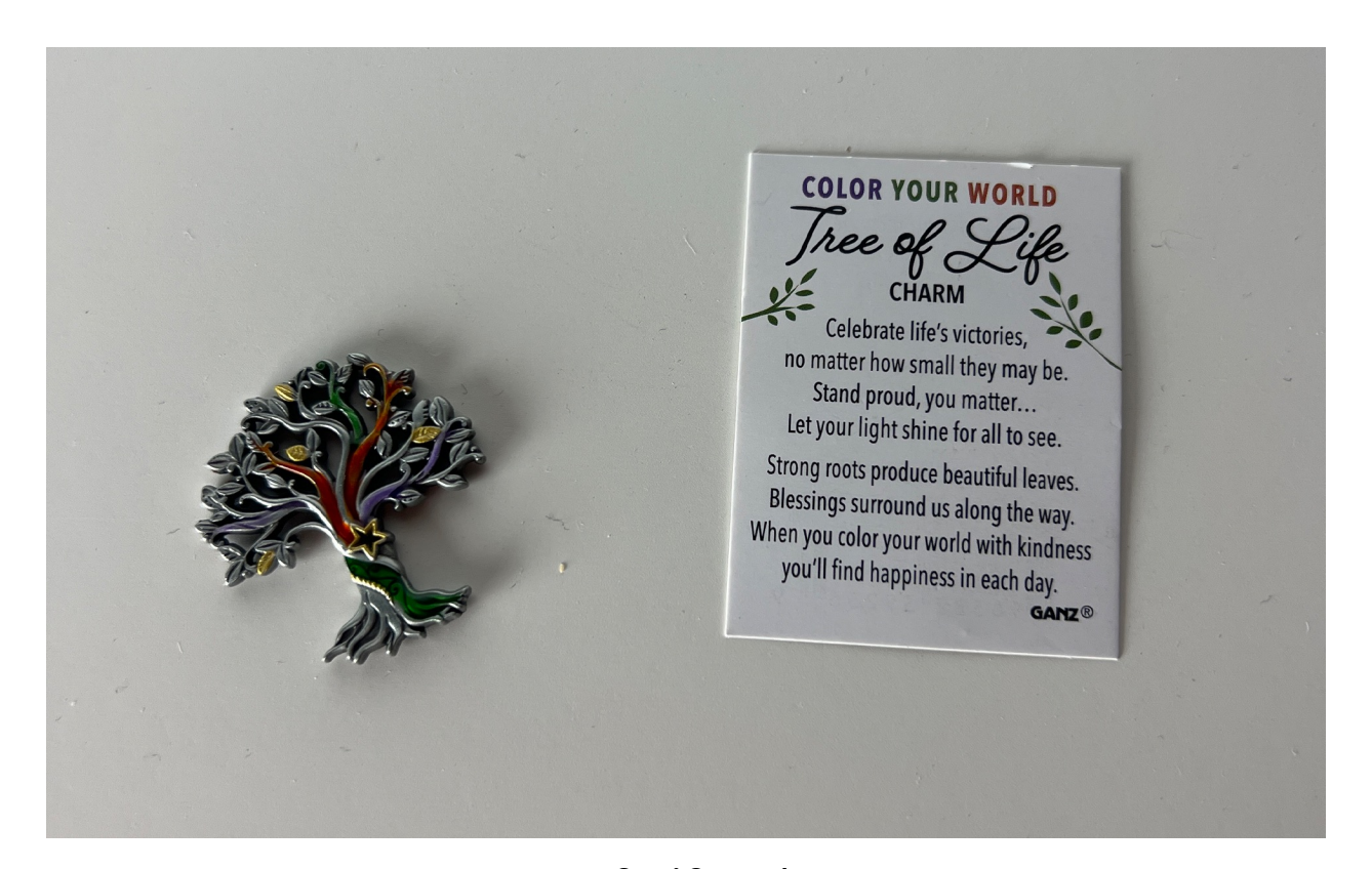
Tree of Life Charm