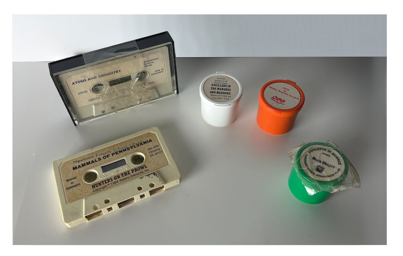
Audio Tapes and Film