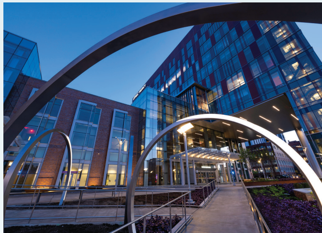
The new UPMC Mercy Pavilion is Leadership in Energy and Environmental Design (LEED) certified.

UPMC has earned national recognition from both the American Society for Health Care Engineering (ASHE) and Practice Greenhealth, two of the most respected organizations advancing sustainability in health care. Together, these awards underscore our commitment to integrating sustainability across operations, facilities, and care delivery.