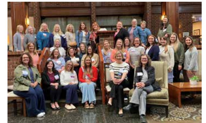
The Nurse-Family Partnership® team is pictured at the NFP State Conference in Harrisburg.

UPMC at Home includes several community-based programs that provide appropriate in-home support to children and families. Programs focus on healthy development, educational growth, and access to vital resources, ensuring that people in even the most remote communities have access to compassionate, comprehensive care. The ability to scale statewide helps to ensure patients receive high-quality, coordinated care no matter where they live.