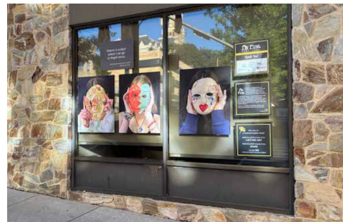
Masks designed by students who participated in "I'm fine" events on display in Schuylkill County.

During Mental Health Awareness Month in May 2025, UPMC CHVHC, Community Care, BHARP, Schuylkill County partners, and the "I'm fine" organization hosted art events to help students express emotions and reduce stigma. A window display featuring student-designed masks and mental health resources was installed in August 2025 at the county's Children and Youth building.