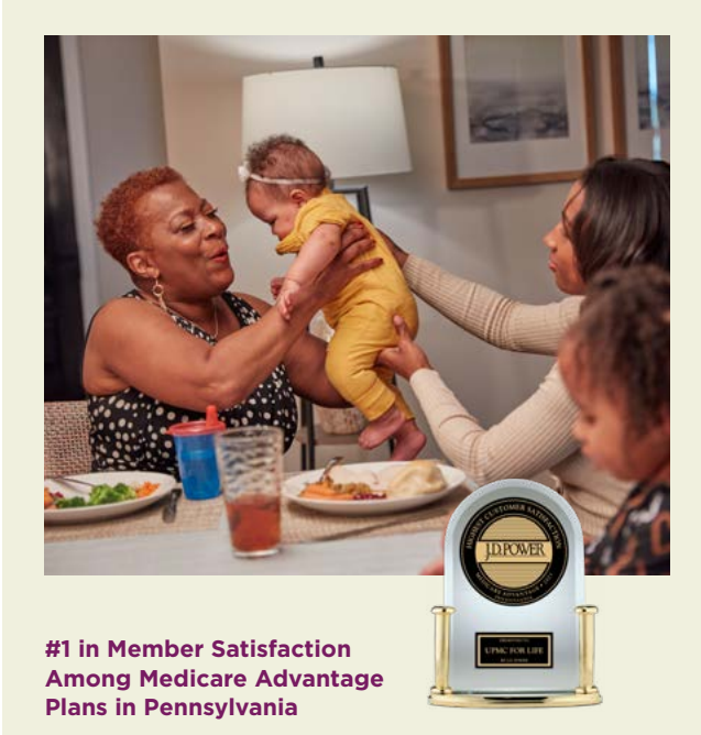
Expanding Ways to Access Exceptional Care for 4.5 million members.

In August 2023, UPMC for Life earned the highest score in Pennsylvania in the J.D. Power 2023 U.S. Medicare Advantage Study<sup>sm</sup> of members' satisfaction with their health plan experience.