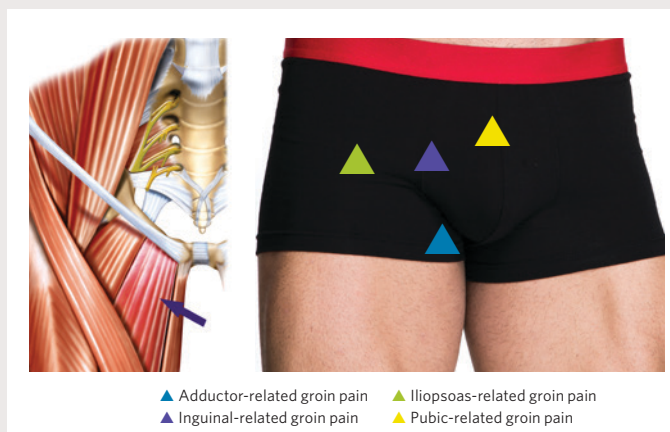
Figure 1. Osseous and musculotendinous anatomy of the groin and palpation examination correlate.

Musculoskeletal groin pain in the athlete goes by many nonspecific and often vague or anatomically misleading terms. Athletic pubalgia, Gilmore's groin, sportsman's hernia, sports groin pain, osteitis pubis, hockey goalie syndrome, adductor tendinopathy, and enthesopathy are some examples. 5,7-9 "Sports hernia" is one of the more common terms used, particularly in media and lay publications, but is misleading by implying herniation or fascial wall weakness, which are not always present. 14