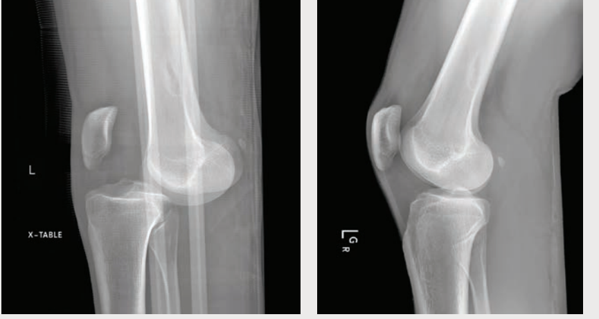
Pre- and post-reduction multiple ligament knee injury x-rays.

(the incidence in the general population is not exactly known but may be approximately 0.072 per 100 patient-years in civilians with orthopaedic injuries<sup>3</sup>), are quite devastating in their consequences. These injuries are often accompanied by significant nerve and vascular trauma, as well as fractures and injury to surrounding tendons and structures. MLKIs often are the result of high-energy trauma incidents, as well as high-impact sports such as football and other strenuous activities such as military training. MLKIs carry with them a range of potential postsurgical and rehabilitation complications. These include poor wound healing, arthrofibrosis, posttraumatic osteoarthritis, pain, and persistent joint instability, among other challenges.