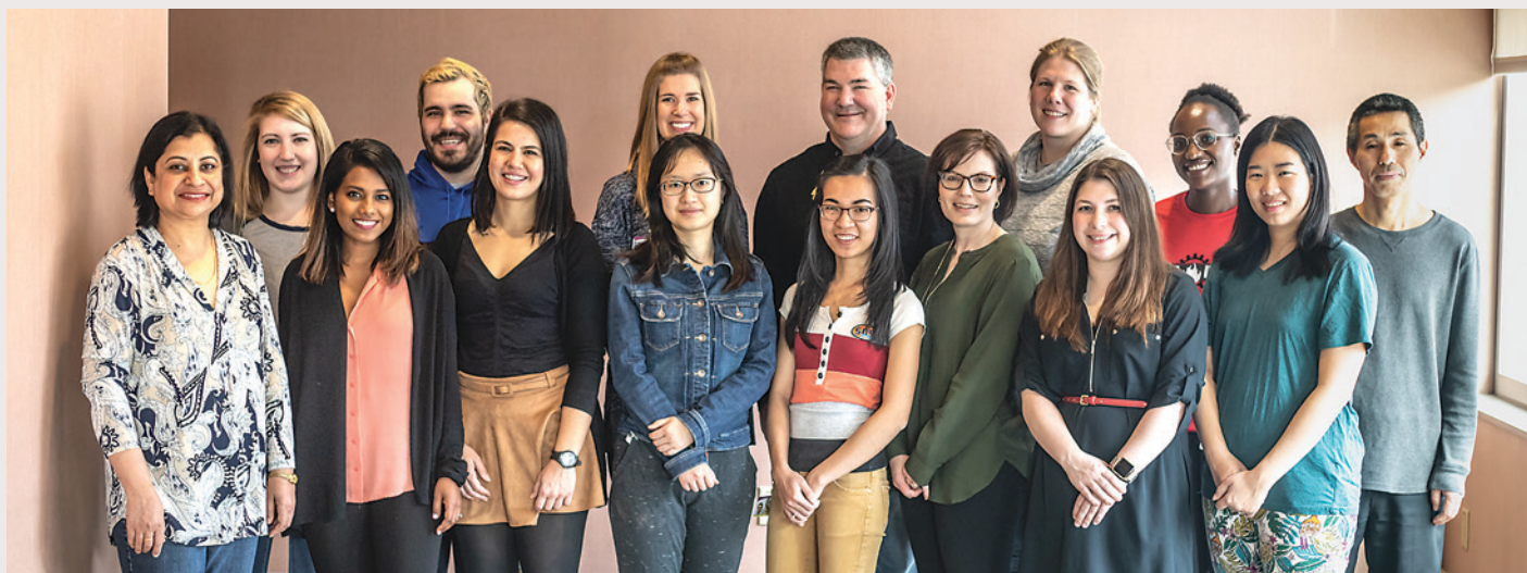
Orwig Laboratory staff members.