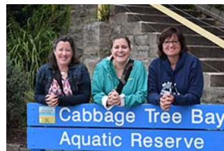
In Manly Bay.